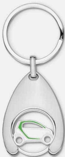
Key ring with shopping trolley chip, electric drive. Stainless steel. Key ring with shopping trolley chip. Length approx. 7.5 cm. B6 799 3021