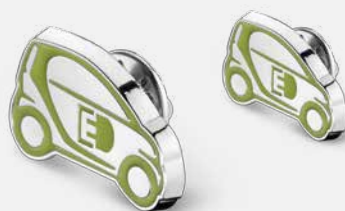
Pin. Silver/green. Stainless steel. Clothing-friendly clasp. B6 799 3022