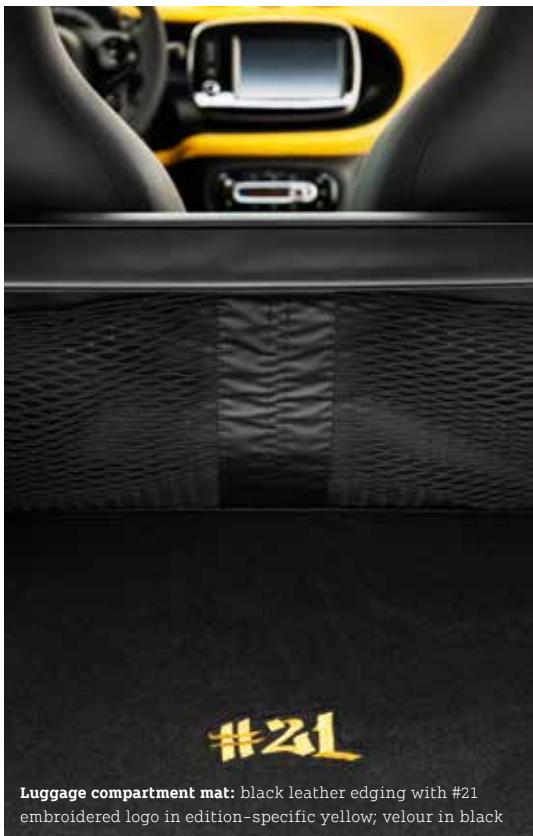
Luggage compartment mat: black leather edging with #21 embroidered logo in edition-specific yellow; velour in black