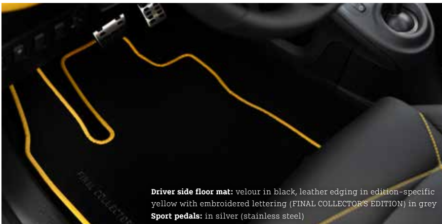
Driver side floor mat: velour in black, leather edging in edition-specific yellow with embroidered lettering (FINAL COLLECTOR'S EDITION) in grey Sport pedals: in silver (stainless steel)