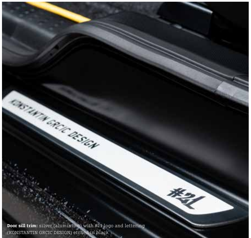
Door sill trim: silver (aluminium) with #21 logo and lettering (KONSTANTIN GRCIC DESIGN) etched in black