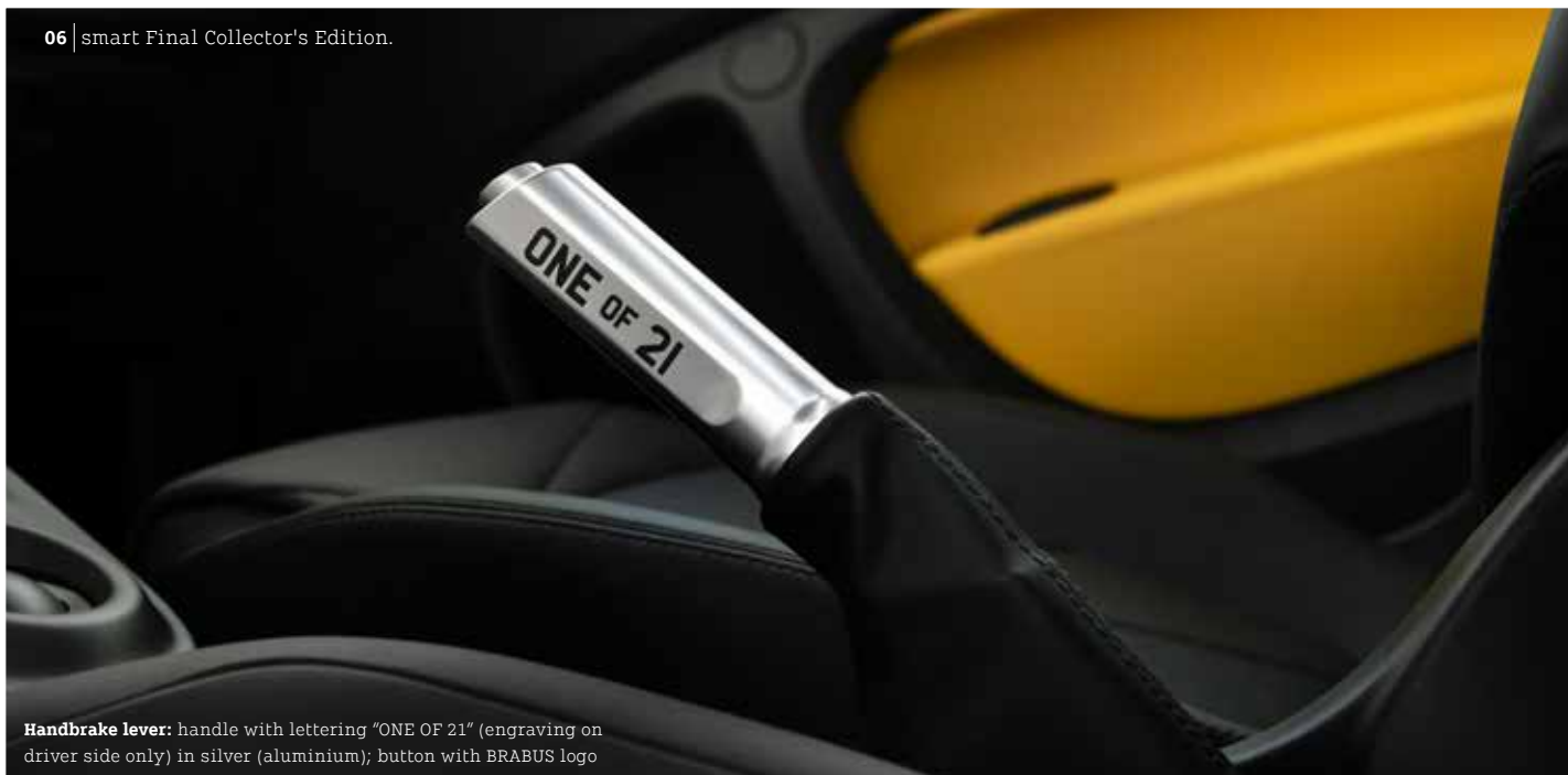
Handbrake lever: handle with lettering "ONE OF 21" (engraving on driver side only) in silver (aluminium); button with BRABUS logo