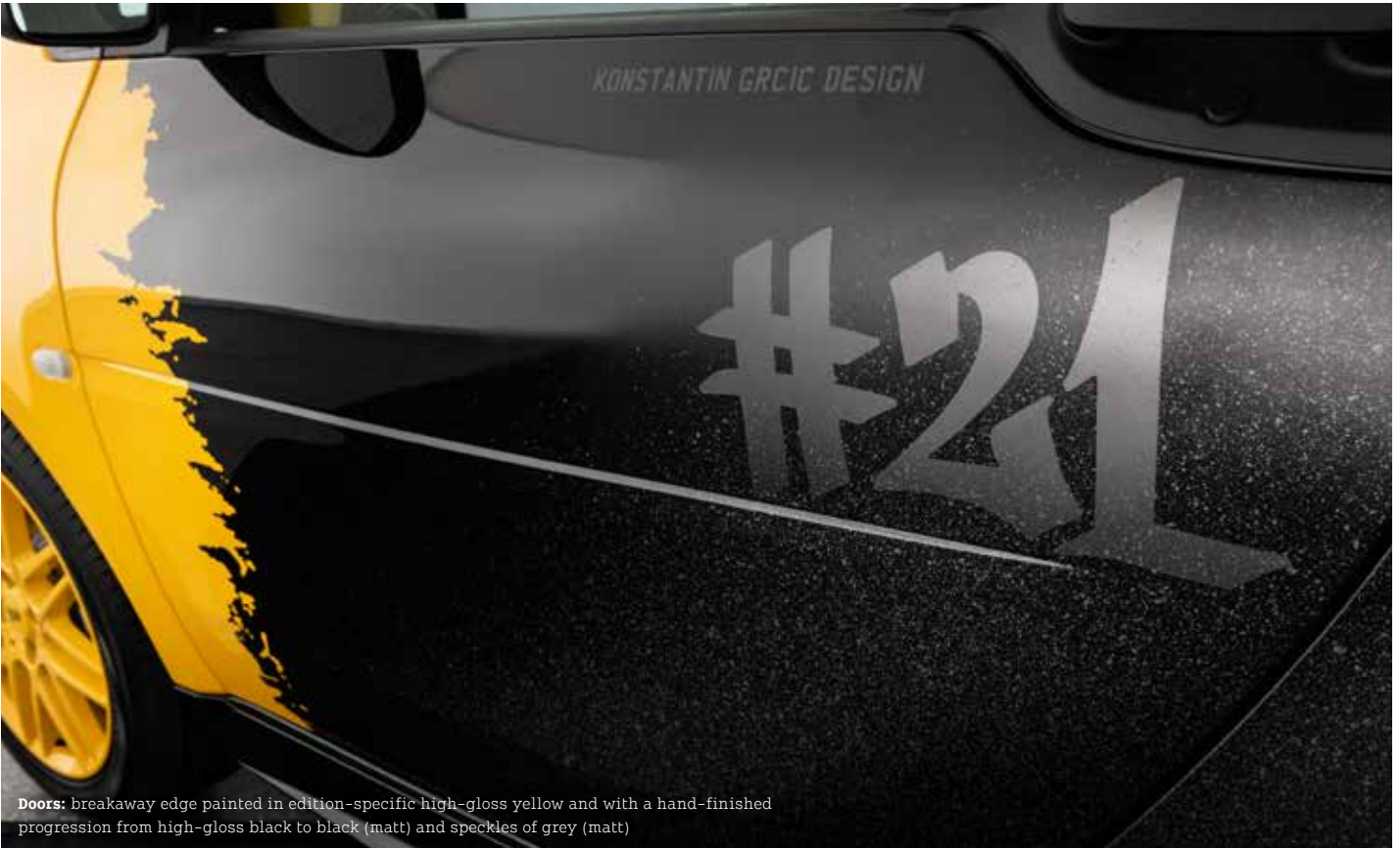
Doors: breakaway edge painted in edition-specific high-gloss yellow and with a hand-finished progression from high-gloss black to black (matt) and speckles of grey (matt)