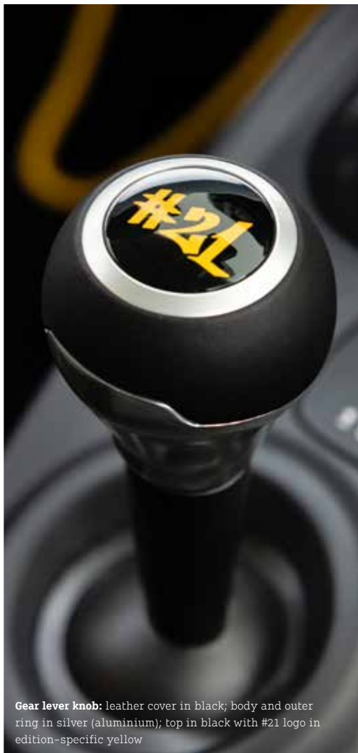
Gear lever knob: leather cover in black; body and outer ring in silver (aluminium); top in black with #21 logo in edition-specific yellow