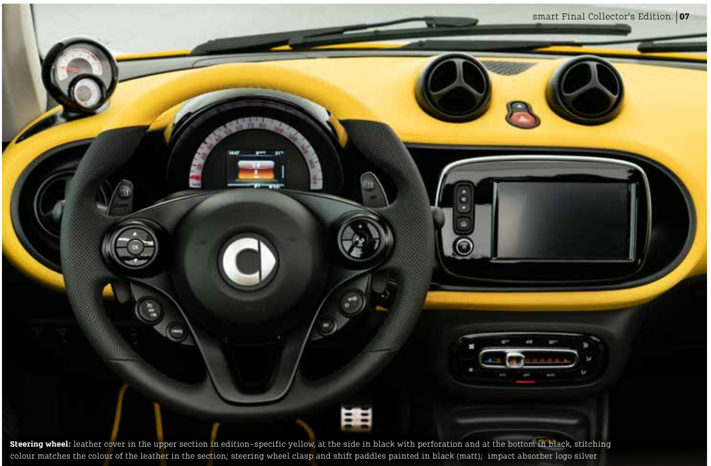
Steering wheel: leather cover in the upper section in edition-specific yellow, at the side in black with perforation and at the bottom in black, stitching colour matches the colour of the leather in the section; steering wheel clasp and shift paddles painted in black (matt); impact absorber logo silver